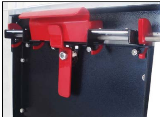
Locked Door - Inside View

LEVEL TWO includes our new 5-point locking mechanism, the CLAW Lock. An 11 gauge stainless steel cam (latch) pushes up on the lift plate, rotating FOUR stainless steel CLAWS into the door bracket receiver. The CLAW Lock quadruples the security of the lock!